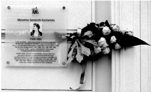
Sembrich Memorial Plaque dedicated at the Wroclaw Opera House in Wroclaw, Poland