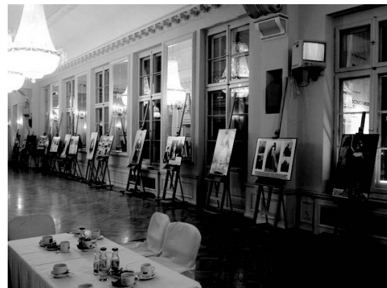
Sembrich photo exhibit in Wroclaw Opera