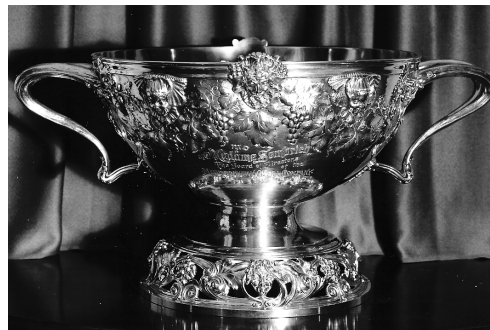
Punch Bowl presented to Mme. Sembrich from the Board of Directors of the Metropolitan Opera Company

Tributes on display from Emma Eames, Enrico Caruso, Antonio Scotti, the Flonzaley Quartet and Polish students in Moscow are lasting legacies of the reverence and high esteem paid to Mme. Sembrich.